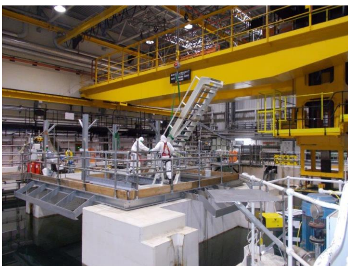
Modifications being made to the former dive platform